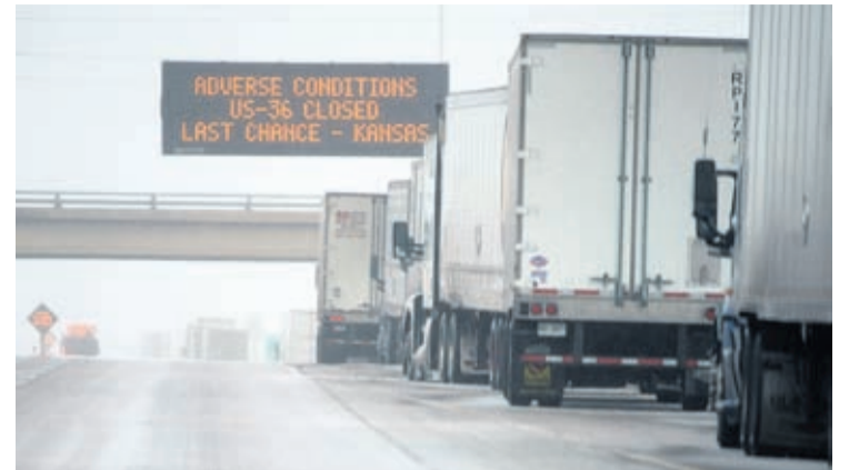
Tractor-trailers are stacked up along the eastbound lanes of Interstate 70 near East Airpark Road, Tuesday, Dec. 13, 2022, in Aurora, Colo.

The agency expects greenhouse gas standards and incentives in the Inflation Reduction Act to bring the replacement of all diesel